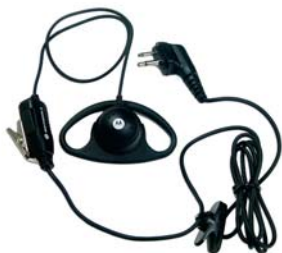
Earpiece with inline PTT & Microphone 56517