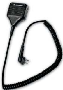
Remote Speaker Microphone HMN9051A