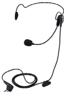
Lightweight Headset with Boom Microphone 53815