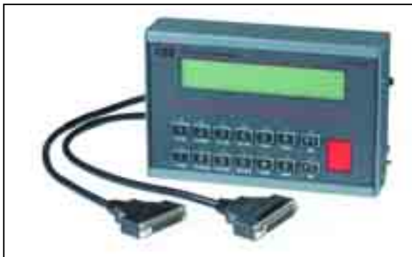
RDN7368A Mobile Display Terminal