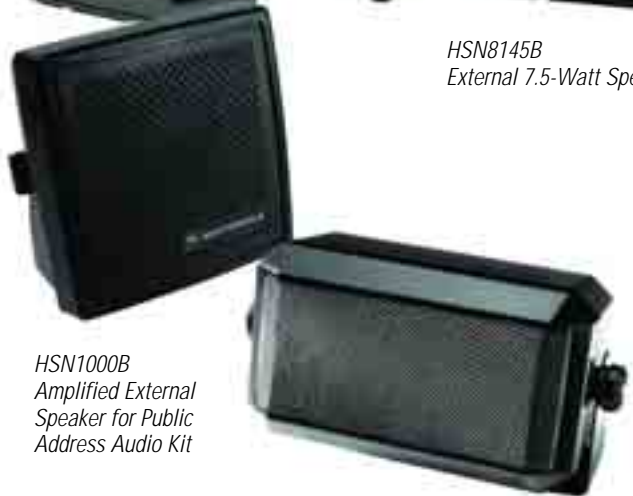
HSN1000B Amplified External Speaker for Public Address Audio Kit