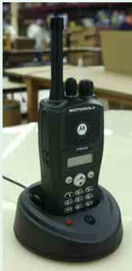
WPLN4138AR Desktop Rapid 90-Minute Charger

(For use with NNTN4496AR NiCd battery only.)