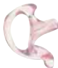
RLN4763A Custom Clear Comfortable Earpiece