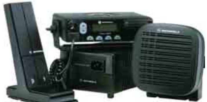
HSN8145B External 7.5-Watt Speaker