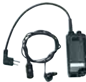
BDN6646C Ear Microphone System, with PTT Interface