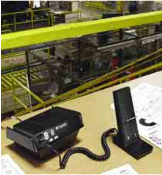
The PM400 is compatible with most Motorola portable and mobile radio accessories.