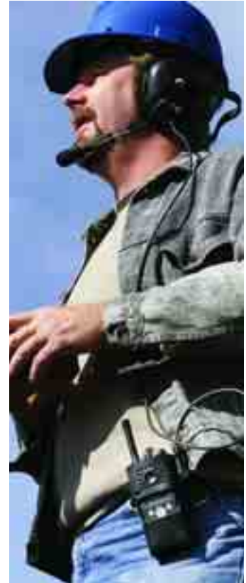
RLN5641A Hard Leather Carry Case with 2.5-Inch Belt Loop

Attaches to D-rings on carry cases to provide added comfort.